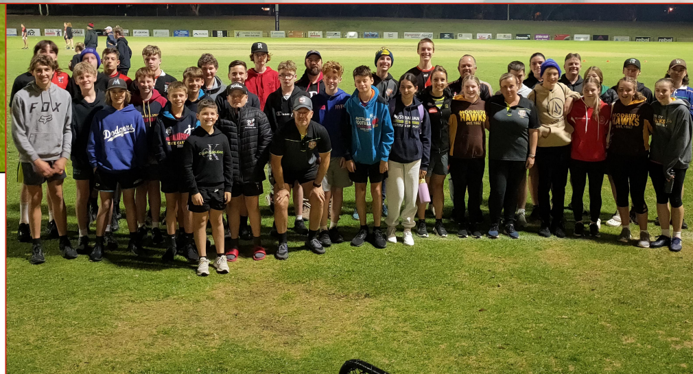
SANFL Junior Umpire Training Program - 2023