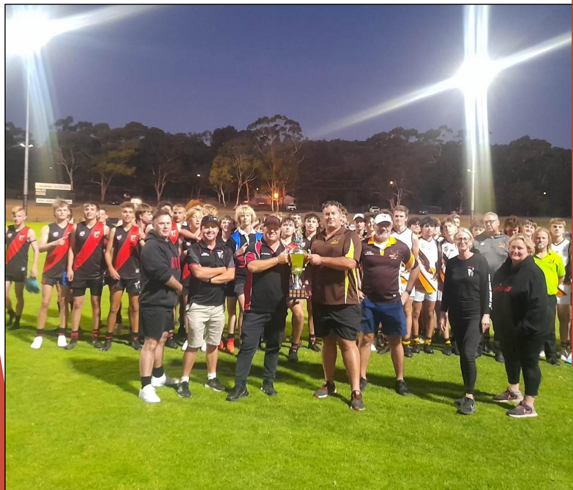
Dawson O'Brien Cup - 2023